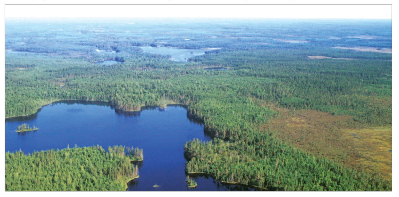
This aerial photograph shows a small section of the sprawling boreal forests in the Karelia Republic, Russia. Much of this mosaic of forests, lakes, rivers, and wetlands, dominated by spruce trees, is virgin forest. However, the region is rapidly changing because of logging.